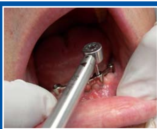
Implant overdenture bar being torqued to place in mouth

Mandibular implant overdentures are one of the solutions to the problems of denture mobility. The implant overdentures will immobilize the denture and create a positive function. Studies have shown that patients with the implant overdentures do feel chewing and eating are significantly easier and they speak more freely, more like with their natural teeth. That is why clinicians should