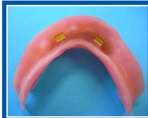
Underside of a lower denture made to fit on an overdenture bar

Implant overdentures start with creating an implant surgeon's guide from a wax try-in or an existing